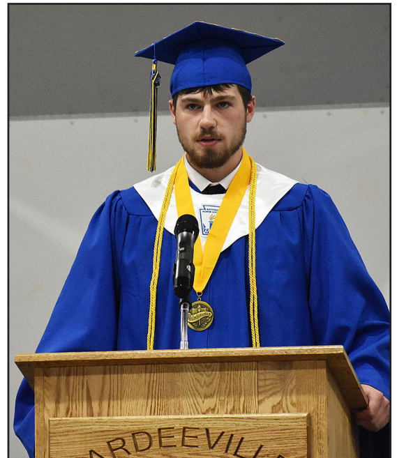
Pardeeville High School Graduation will take place on May 23 in the school's gym.

Pardeeville High School congratulates the Class of 2026 on their achievements and looks forward to honoring this milestone together.