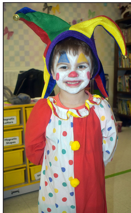
Funny clowns were part of the annual 4K Circus held at Pardeeville Elementary School on March 27.

In addition to providing entertainment, the circus experience offered valuable benefits for students. Performing in front of an audience helps build confidence, encourages teamwork, and strengthens communication skills at an early age.