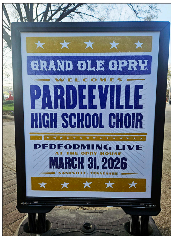
The Pardeeville High School Band and Choir got to perform at the Grand Ole Opry in Nashville on Tuesday, March 31.