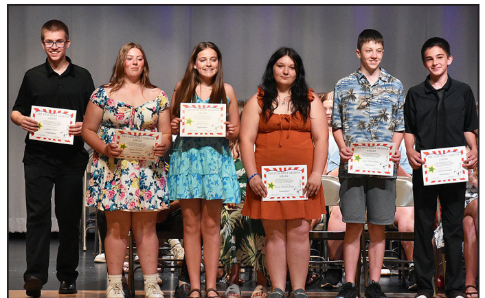
The Pardeeville Middle School 8th Grade Promotion and Awards Ceremony will take place on June 4.