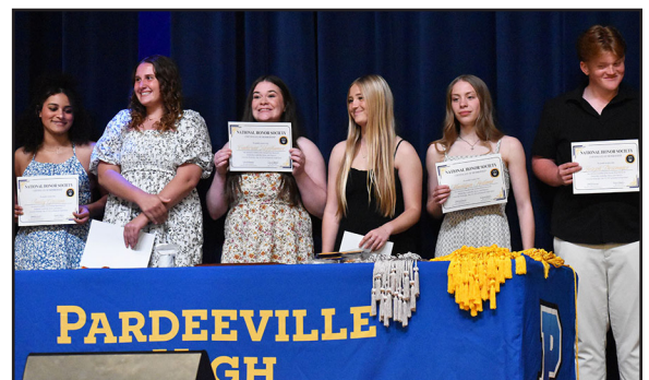
Students collect scholarships and awards at last year's Pardeeville High School Awards Night. This year's Awards Night will be on May 13.