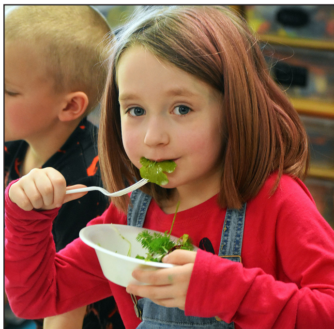
A Pardeeville Elementary School 5K student enjoys a salad that she and her classmates harvested from a micro garden they planted back in February.

Thank you to the Columbia County Master Gardeners and the UW Extension Office for their continued partnership and for providing our students with a meaningful, engaging learning experience that brought science, teamwork, and healthy habits to life.