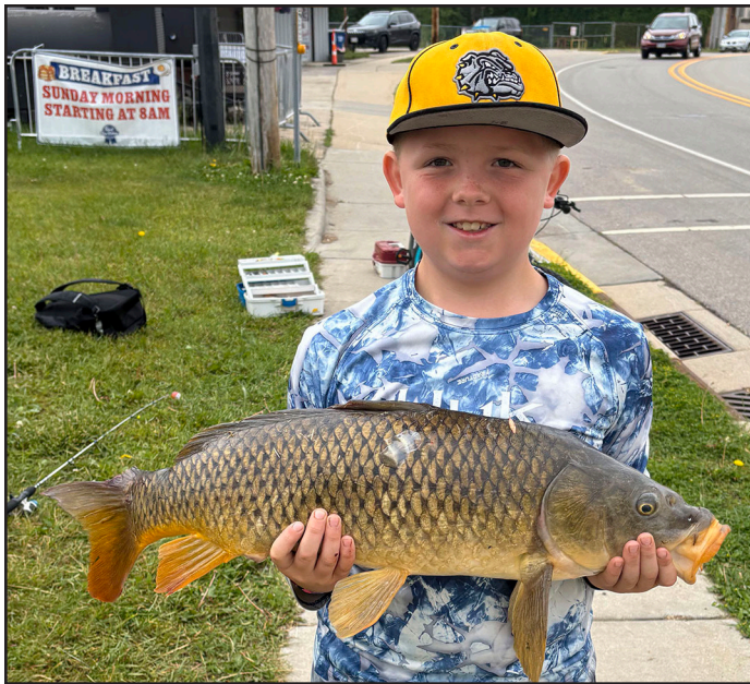
The fishing class is always one of the most popular choices for kids in the Summer School program.