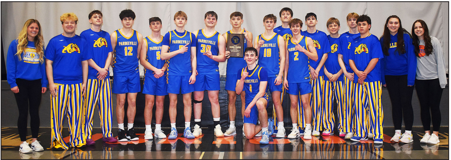
Members of the Pardeeville boys basketball team pose for a photo following their 70-55 win over Horicon in a Division 4 regional championship game at Horicon High School on Saturday, March 7.