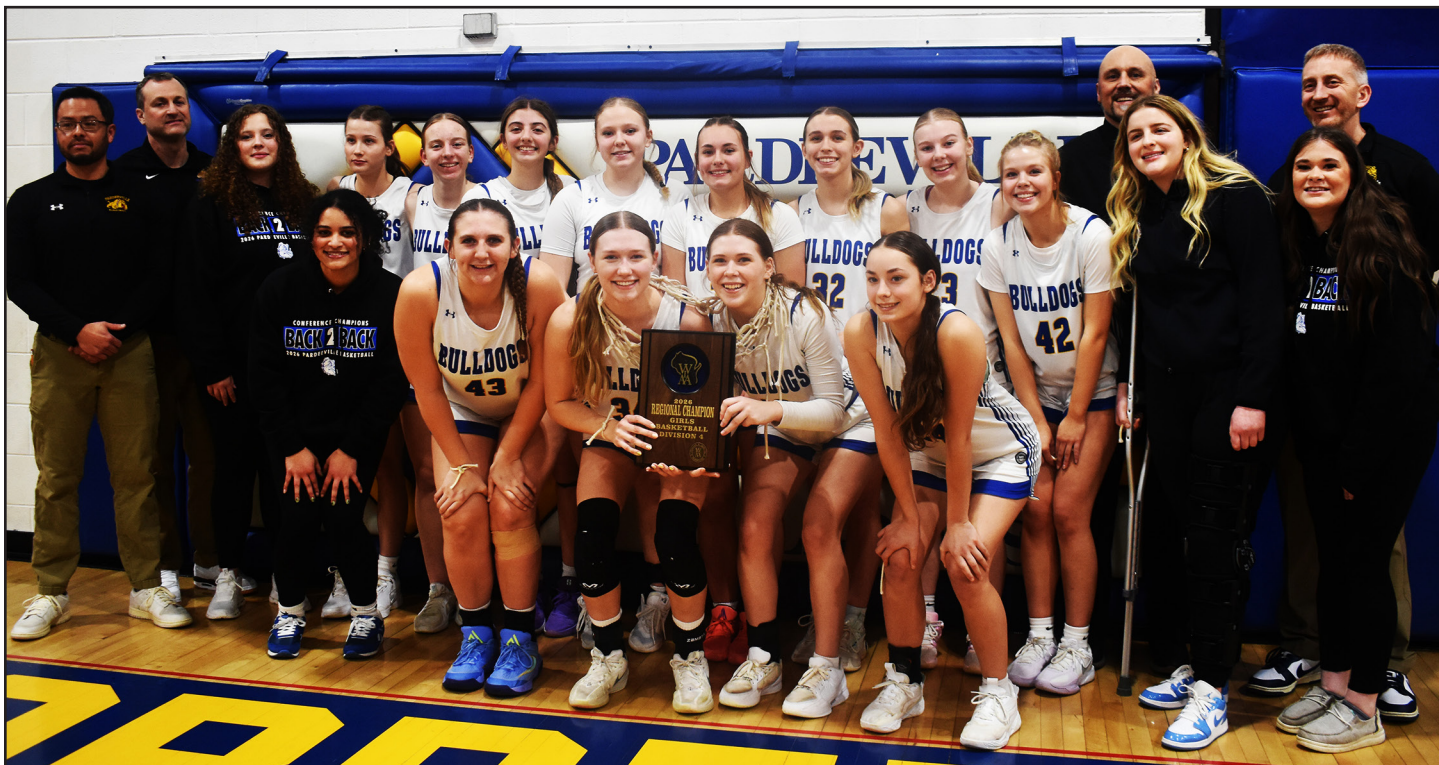
Members of the Pardeeville Girls Basketball team pose for a photo following their 68-52 win over Melrose-Mindoro in a Division 4 regional championship game at Pardeeville High School on Saturday, Feb. 28.